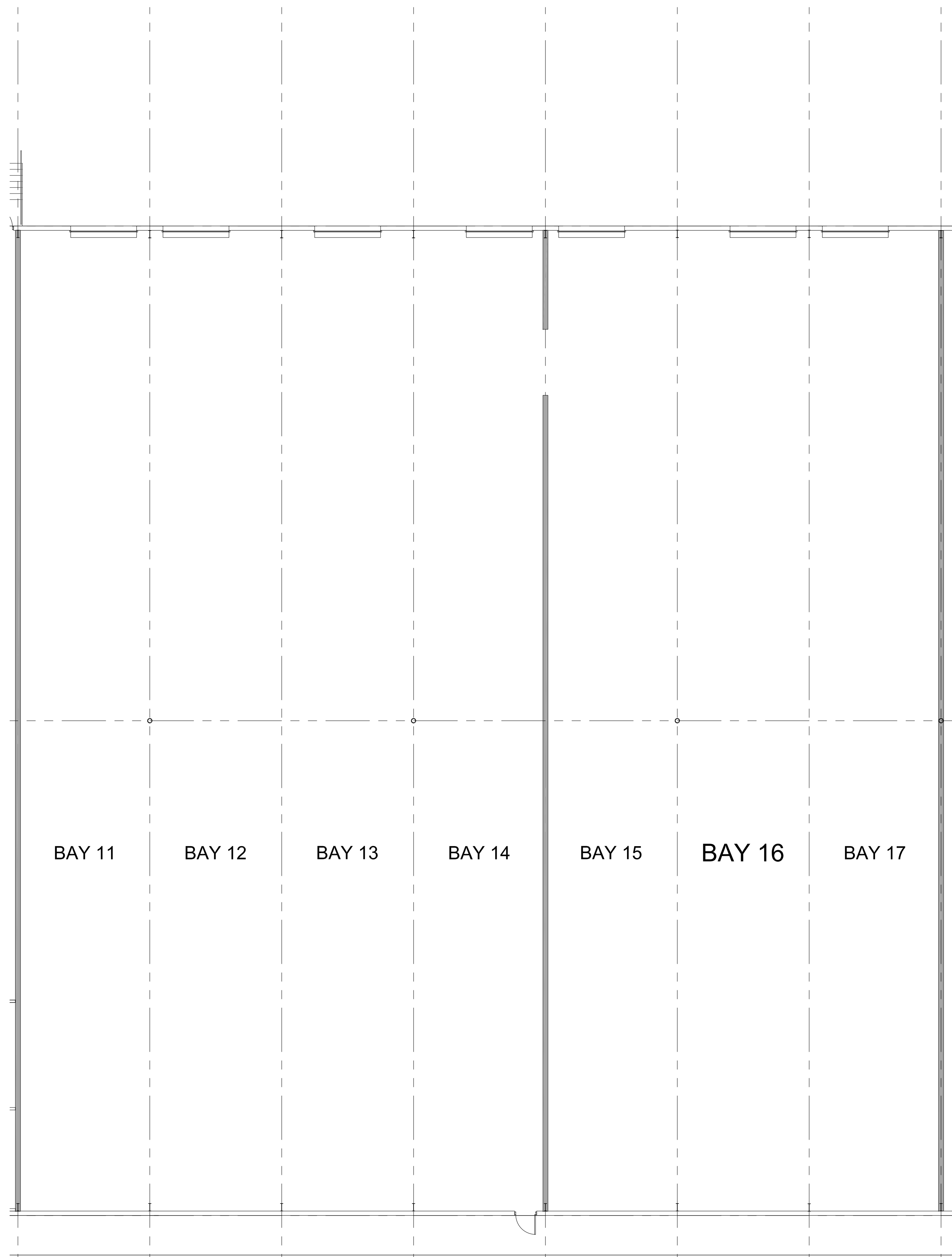
1 FLOOR PLAN 3/32" = 1'-0"